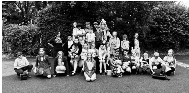
Ladybirds go to the beach