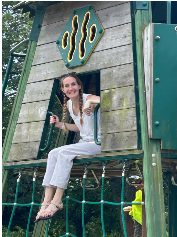
The Mundham Mudder