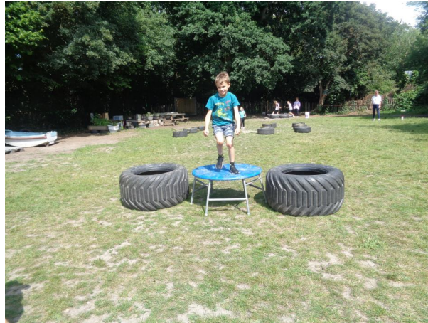
Year 4 Camping at Stedham