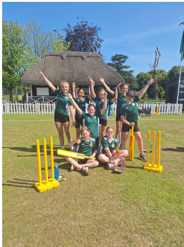
Year 5 Forest School