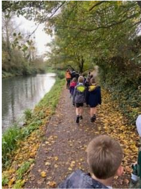
Year 5 assembly