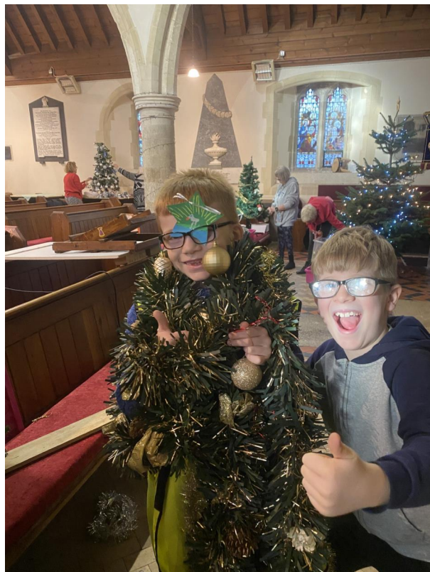
St Stephen's Christmas tree festival