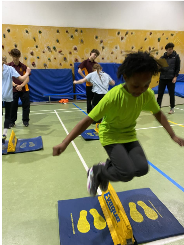
Year 5 and 6 cricket team