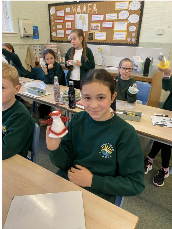
Mundham Inspiration Talk